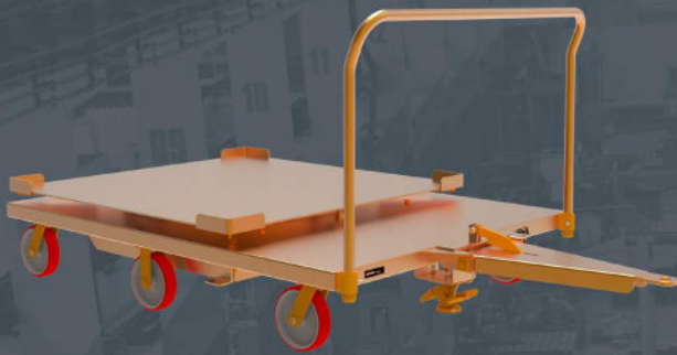
6-Wheel Pivot Steer Trailers