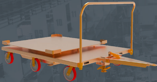
6-Wheel Pivot Steer Trailers